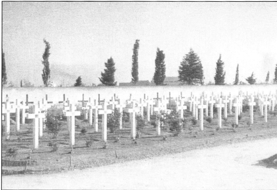
American Graves - Casablanca Cemetery, North Africa